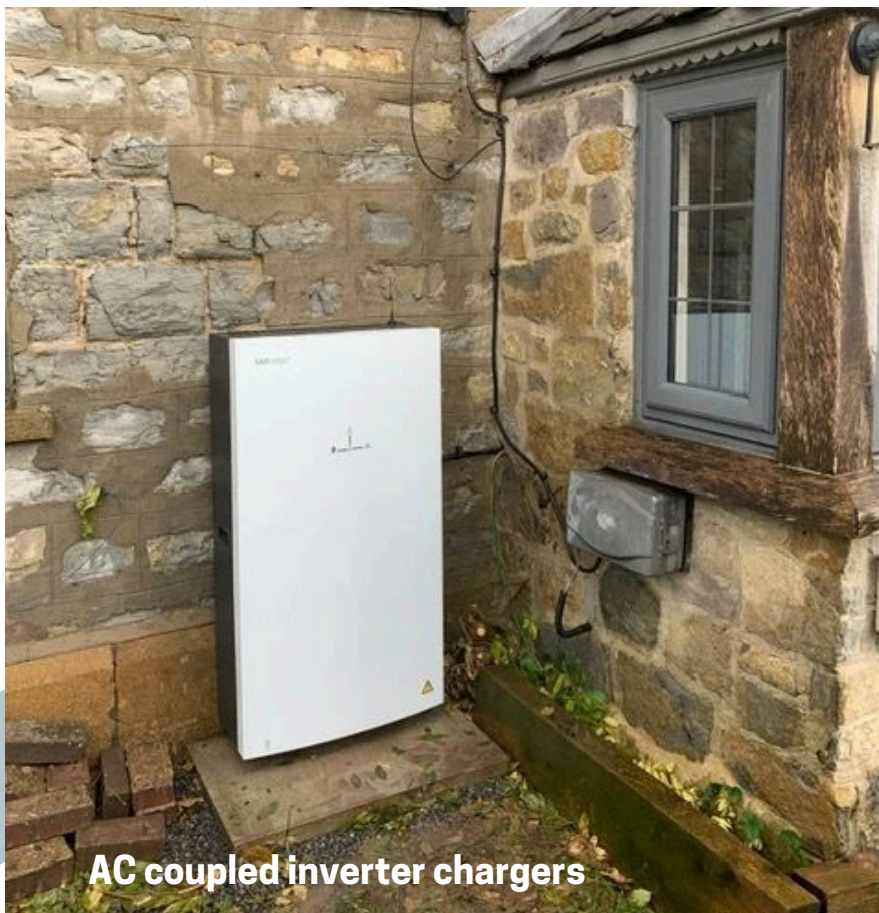
AC coupled inverter chargers

Full scheduling and installation service available for both