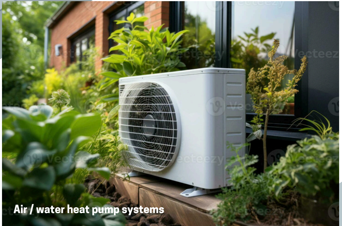
Air / water heat pump systems